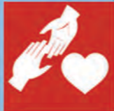
Learning for Life and Work