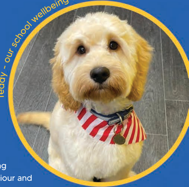
Teddy - our school wellbeing dog